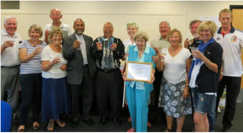
Left: Chesham in Bloom volunteers celebrate their Gold Award from Thames & Chilterns in Bloom