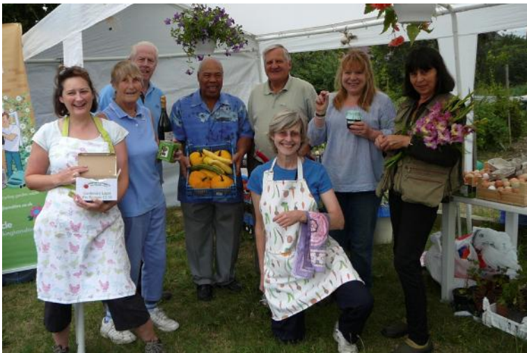
Above: Chesham Allotments Group displaying allotment produce at the Cameron Road allotments Open Day