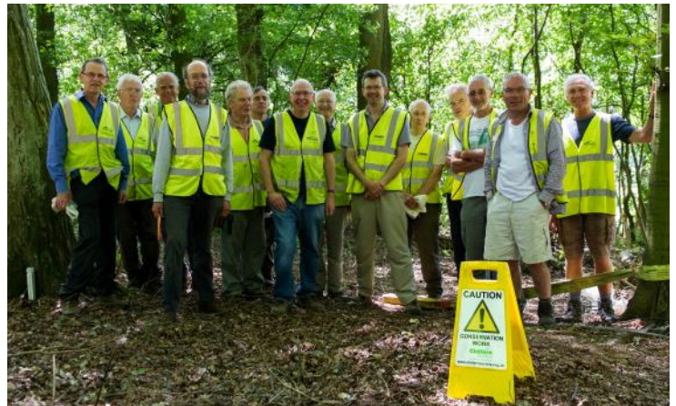
Above: Volunteers from the Chiltern Society working at Captain's Wood in northern Chesham.