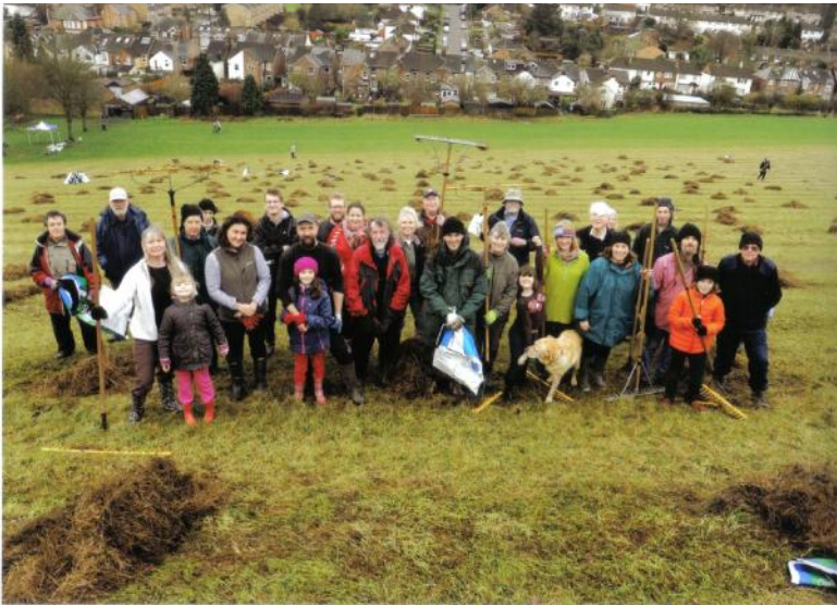
Left: Chesham Environmental Group working in partnership with Chesham & District Natural History Society to manage the chalk grassland habitat at the Town Council's Berkhamstead Field