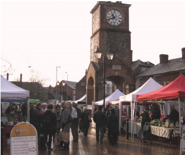
Above: Chesham Local Produce Market run by Transition Town Chesham in partnership with the Town Council brings lots of visitors to the newly regenerated Market Square every month